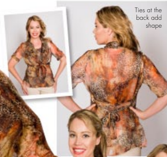
Ties at the back add shape